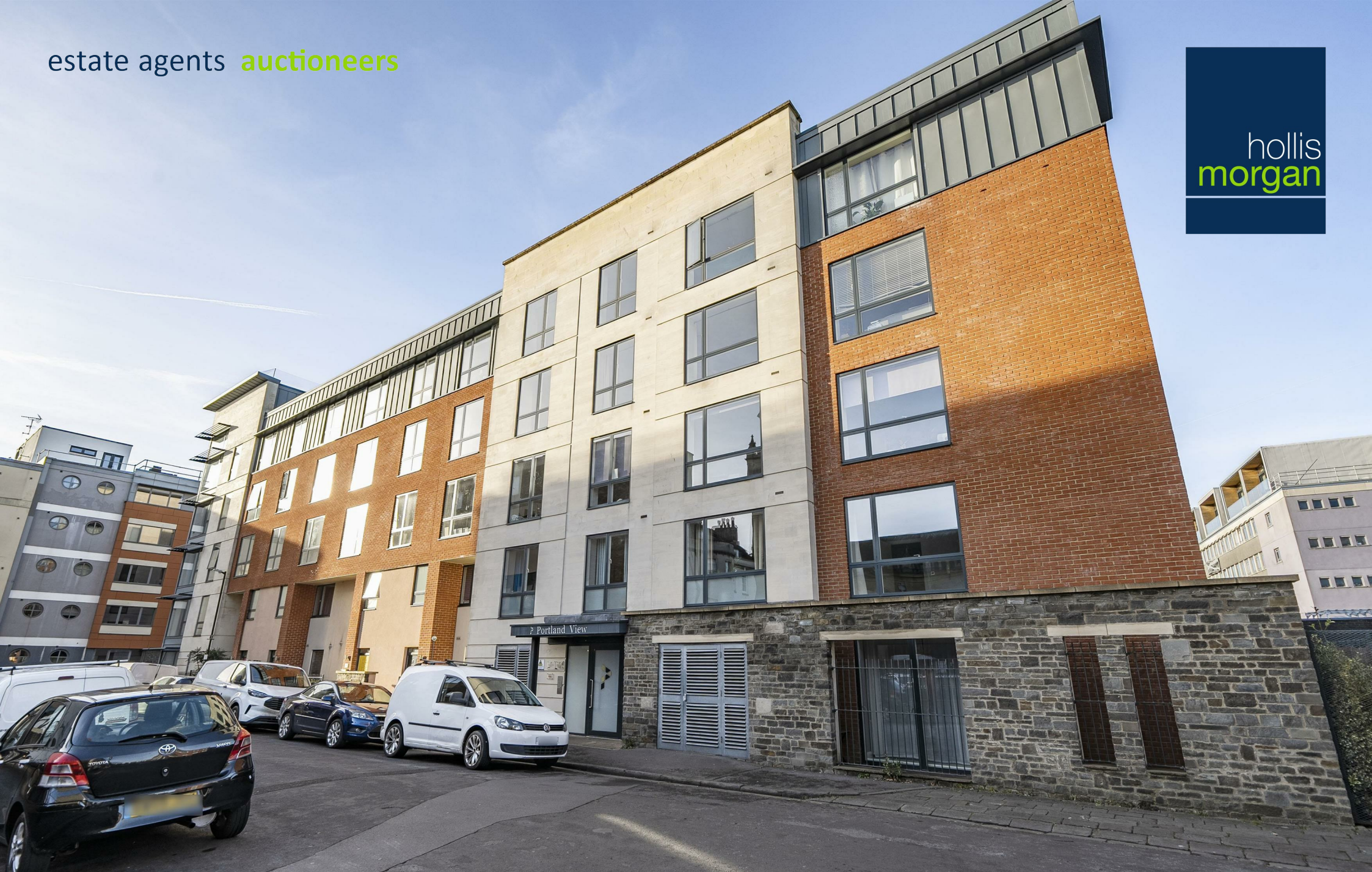
21, Portland View Bishop Street, Bristol, BS2 8FH Offers In Excess Of £285,000